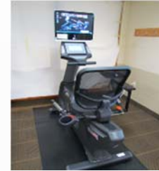
Children's Fitness Center