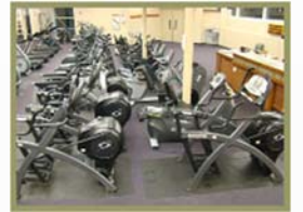
Fitness Floor Walking Track

The SCC features a 9,000 square foot fitness area with free weights and Cybex Select Rise. Also featured are Precor, Star Trac, Woodway, and Cybex cardio-vascular machines, and an Instruction Studio. The Reasbeck Natatorium, offering a co-ed Spa, Training Pool and Main Pool, is located next to the men's and women's locker rooms. Each locker room is equipped with a dry sauna and locker service. Two gymnasiums, a walking/jogging track, ample meeting rooms, a Children's Fitness Center, Childcare Center, and banquet rooms are available to meet any occasion.